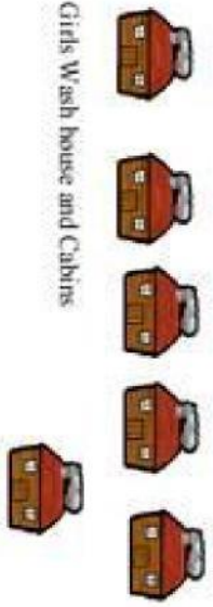
Girls Wash house and Cabins