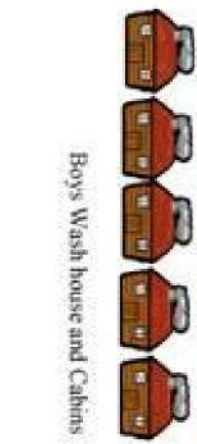
Boys Wash house and Cabins